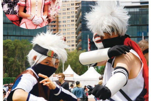
Photo shooting with Cosplayer at the sub-stage.